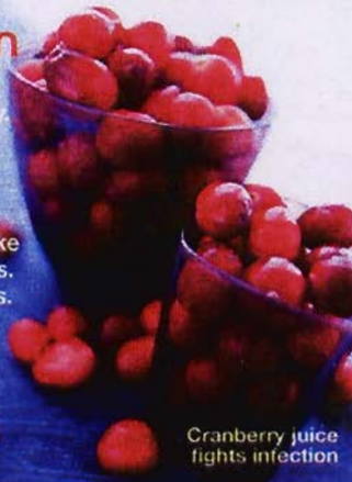
Cranberry juice fights infection

Fix Choose another form of contraception.